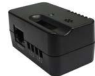
10120545 - EMD for NMCCard