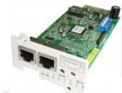
10120564 - Modbus Card