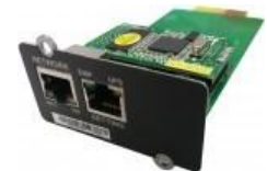
10120517 - NMCCard